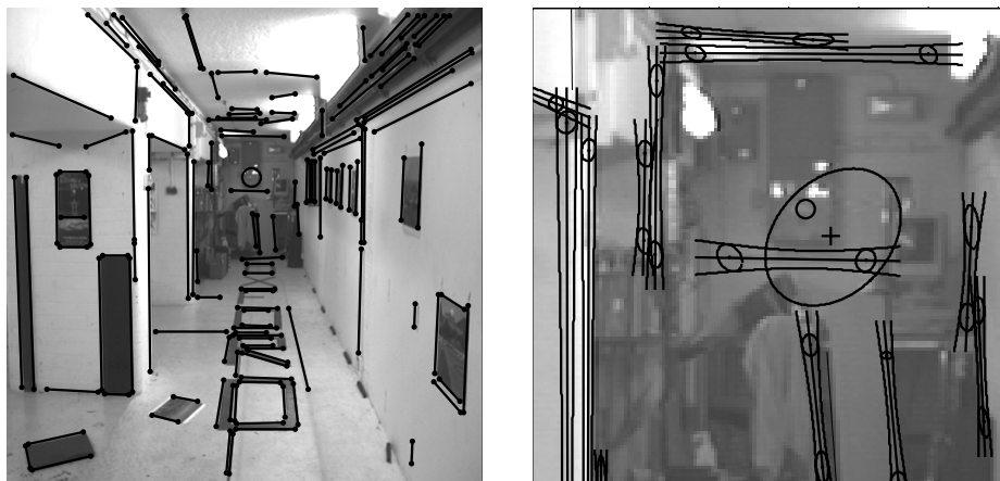
Fig. 2. First image of the Oxford corridor sequence. Left: Extracted straight line segments, classified according to their vanishing directions and an outlier class. Right: Display detail with superimposed confidence regions, the approximate third vanishing point ( \circ ), and its estimation ( + ).

Figure 2 shows on the left side the first image of the corridor sequence with extracted straight line segments provided by the Visual Geometry Group, University of Oxford. By using a random sample consensus [?] the segments have been classified according to the 3 vanishing directions and an outliers class.